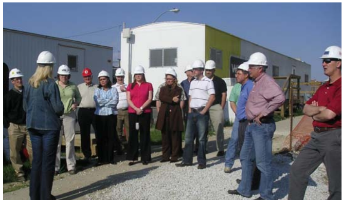
May dinner meeting tour of the Principal Life Insurance Child Development Center